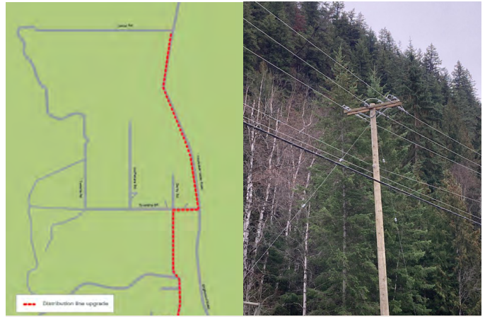
The old single-phase line was upgraded to a three-phase line.

This work follows a similar project that took place in 2021 in Rosebery, where BC Hydro upgraded the distribution line that runs along Highway 6. Approximately 1.7 kilometres of single-phase line was upgraded to a three-phase line, and we also installed nine new poles along Highway 6.