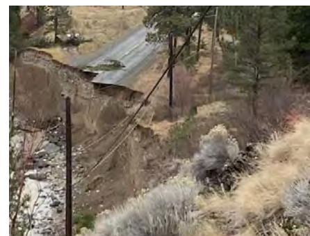
Highway 8 following the atmospheric river in November 2021.

Previously evacuated customers who return to their home can expect to see the evacuee credit applied to their account 30 to 60 days after returning. BC Hydro will continue to waive late payment charges. Once the credit is applied, there are further options available to assist these customers with any remaining balances.