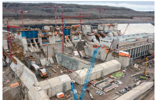
This aerial view shows Site C's spillways, penstocks, powerhouse and operations building for BC Hydro's third dam along the Peace River.

At the same time, we are working with existing customers and municipalities to find capacity and identify suitable industrial sites for these customers. If you have questions about the Load Attraction Program, please contact Business & Economic Development .