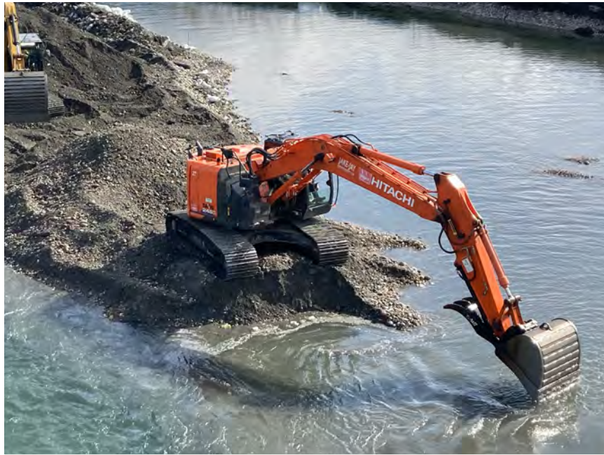
In March 2022, BC Hydro removed about 68,000 cubic metres of gravel from the mouth of the Illecillewaet River, where it flows into Arrow Lakes Reservoir in Revelstoke. The dredging project is part of a tri-party agreement with the Province and the City of Revelstoke. BC Hydro periodically removes accumulated river gravel and excavates a deep channel in the river to reduce the risk of winter ice jams that can cause flooding to low-lying residences.

The upgrades will maintain system reliability by replacing end-of-life equipment. While the project will keep the capacity of the substation unchanged, the upgrades will allow for future expansion of the facility if a need for additional capacity arises. Construction began in June 2022 and will continue until early 2024.