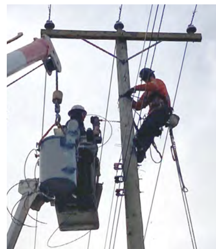
BC Hydro crews restoring electrical infrastructure in the Village of Lytton in January 2023.