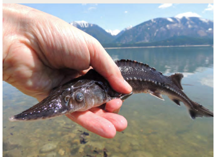
A juvenile white sturgeon.