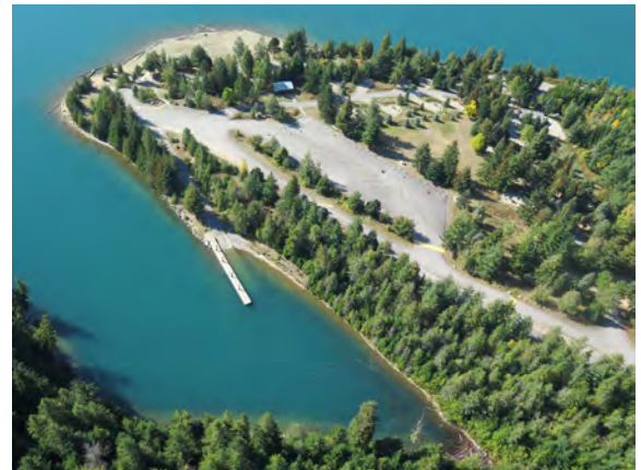
The popular Martha Creek Provincial Park on Revelstoke Reservoir in September 2022.

The work was completed ahead of schedule and in time for the opening of the provincial park in May 2022.