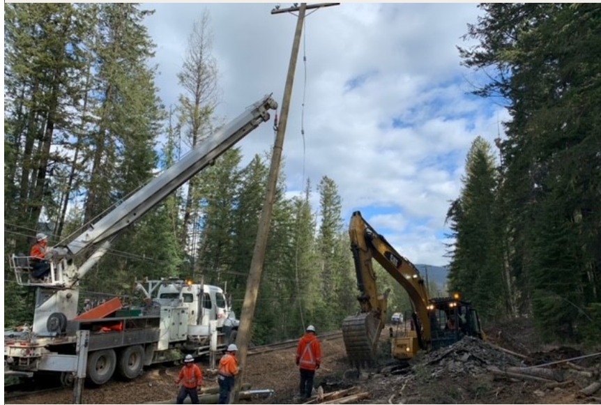
Crews near Field, B.C. working to restore power and protect the electrical supply for our customers.