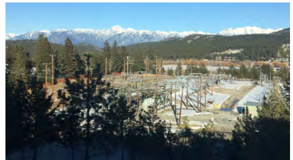
Located in Cranbrook's industrial area, Joseph Creek Substation is undergoing a $17 million upgrade.

We're committed to delivering safe and reliable electricity to our customers throughout the province. In keeping with this commitment, we are investing $17 million to upgrade equipment at Joseph Creek Substation in Cranbrook to improve its reliability and safety. The substation serves about 1,700 customers in Cranbrook, Fort Steele, Wycliffe and ʔaąam.