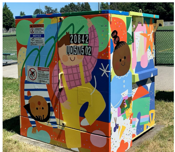
Example of a decorative wrap added to BC Hydro equipment.